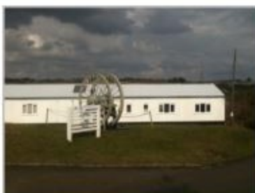
Site entrance to Kensa Engineering

For directions from Truro, the A30, & Falmouth, turn to the next page.