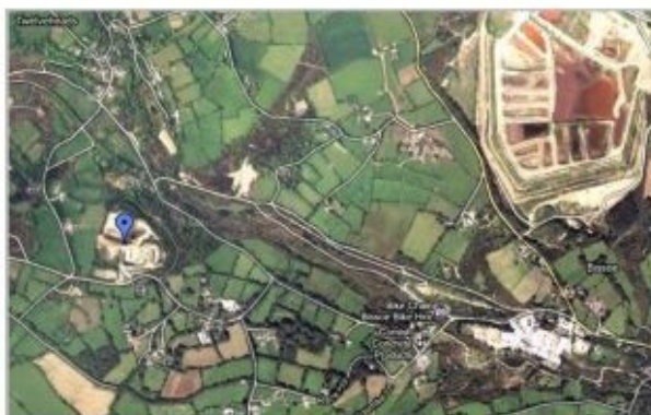
Satellite image of Kensa Heat Pumps (blue pin)